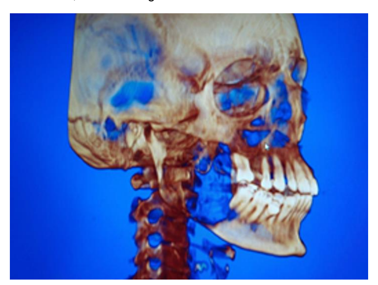
Fig. 1. Facial tomography reconstruction before surgery

We opted for hemi mandibulectomy with safety margins. To better delimit the margins for tumor resection and reduce surgical time, virtual surgical planning was carried out for mandibular reconstruction with a unilateral customized prosthesis (Fig. 2), mandibular template on the right side, temporal template on the right side, mandibular cutting on the right side, and positioning guide on the right side.