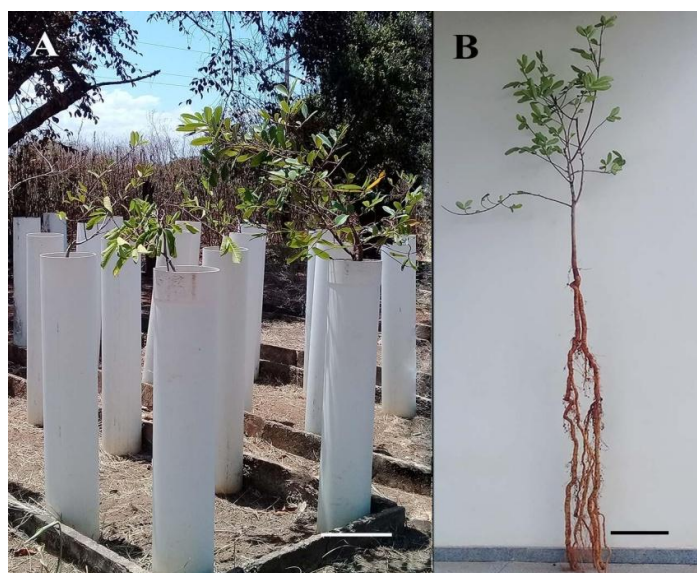
Fig. 1. A. Conditions of cultivation in a garden, seed propagation. Scale bar = 25 cm B. General overview of an adult plant being removed from the cultivation tube, showing ramification of the taproot at about 50 cm depth. Scale bar = 25 cm