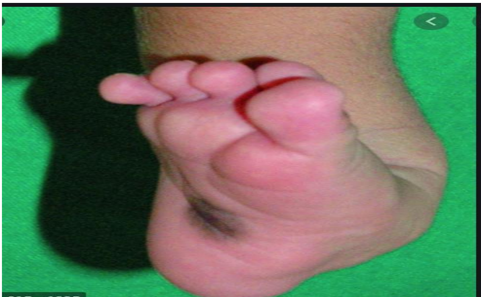
Fig. 2. The infant was diagnosed with amniotic band syndrome with talipes equinovarus deformity of her left foot