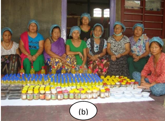
Fig. 2. (a) Carambola fruit and (b) members of Lamjing SHG with carambola products