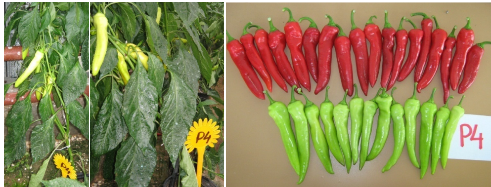
Fig. 4. Plants and fruits of androgenic genotype P4

The fruit was characterized with weight of 42.84 g, contains averagely 7.37% dry matter, 76.71% fruit flesh and 0.25 cm pericarp thickness. P4 fruit is classified as long, horn-shaped, medium-size and medium-fleshy pepper. The total yield gained in this research was 1.449 kg/m 2 . One plant was averagely loaded with 5.80 fruits weighting 231.90 g. According to production traits, in the given agroecological and cultivation conditions, it is a low-yield pepper genotype.