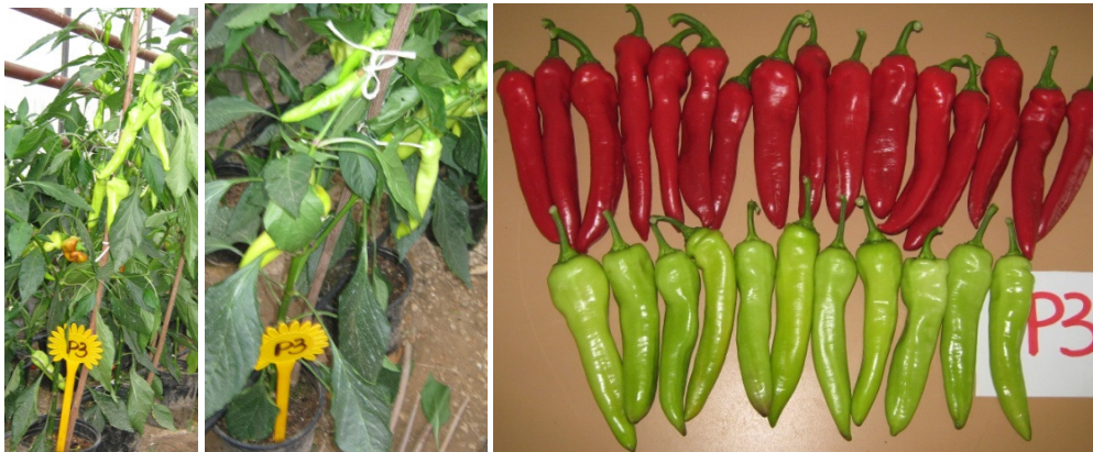
Fig. 3. Plants and fruits of androgenic genotype P3