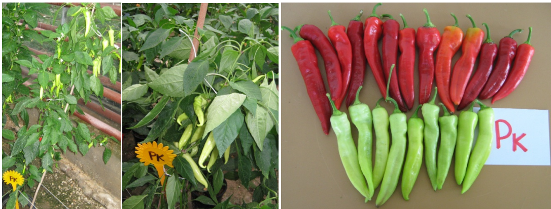
Fig. 1. Plants and fruits of variety Piran used as control genotype in the experiment

The mean internode length of studied genotypes has not shown statistically significant difference. Longer internodes were measured during the first two experimental years as compared to internode length in the third and the fourth experimental year. Many plants, including pepper, have internodes length which is determined by day-night temperature variations, which is mainly due to increased cell elongation than due to increasing of cell number. Peppers have shorter internodes when difference between day and night temperatures is smaller [23]. Morphological characterization of anther derived plants in minipaprika showed variation in leaf size, petiole and internode length, flower bud size, nodal color, leaf color, and leaf shape of diploid lines of each minipaprika. As expected, the researchers recorded reduced plant height, leaf size and internodes for haploid regenerants [21,24].