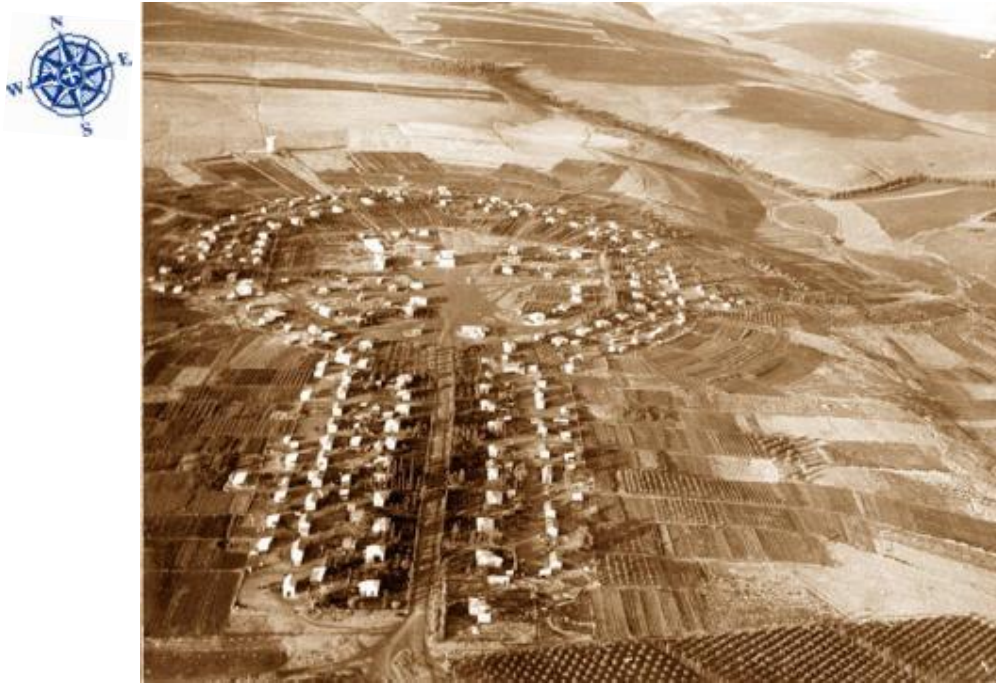
Fig. 3. The decentralized structure of the family farm (Moshav Kfar-Yehezkel, 1936) 200 m

when comparing the photos in Figs. 4a/4b, taken in 1941, with the photo in Fig. 5, which was taken in 1956.