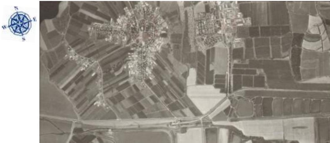
Fig. 9. The specialization process of the family farm and the reduction of the number of agricultural plots (1973)