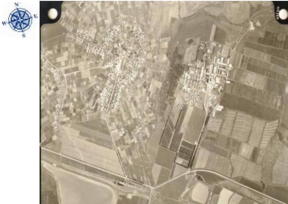
Fig. 8. Decentralization of the family farms vs. centralization of the kibbutz remained relatively unchanged (1961)

The two communities continued to develop in parallel. Fig. 9 shows the two communities in 1973 with very few changes. In Kibbutz Geva you can see concentrated in a single area the new dairy farm that was built in the mid-1960s with a modern milking parlor. This farm, which includes all of the various branches of the dairy is east of the old one as seen in an aerial photograph of 1961 (Fig. 8). In 1964, the 'Bakara' factory was built on the grounds of the old dairy and the new dairy was moved eastward and was concentrated together with all of the other livestock and the poultry divisions that were downsized or closed. The kibbutz fruit orchards included citrus and pecan trees, changes that reflected the transition from a mixed to a specialized farm economy. In addition, they also show the vigorous development of Kibbutz Geva's economy during the 1960s, and the development of industry on an agricultural kibbutz. The residential area had not changed since 1956 showing that the kibbutz population remained stable over this time period.