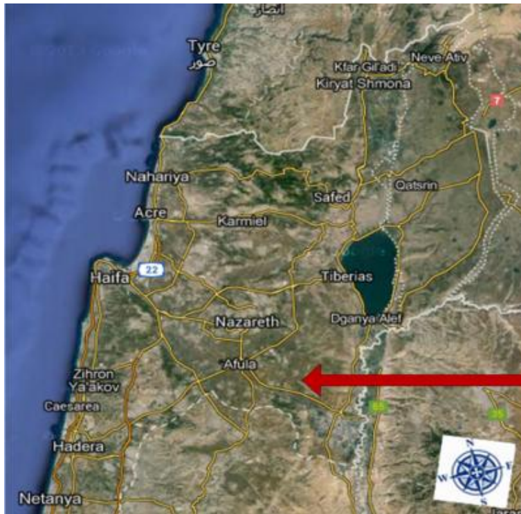
Fig. 1a. Recent aerial photograph (2014) of the location of Moshav Kfar-Yehezkel and Kibbutz Geva (Map of Northern Israel) ← ~ 25 Km