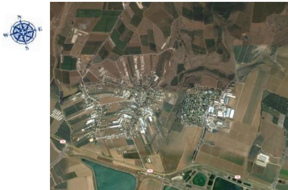
Fig. 1b. Recent aerial photograph (2014) of Moshav Kfar-Yehezkel (left) and Kibbutz Geva (right) ← 1 Km