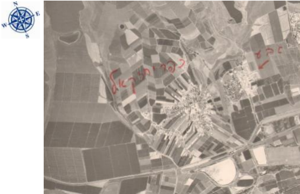
Fig. 6. The decentralized family farm vs. centralized farming on the Kibbutz (1984) ←→ 1 Km