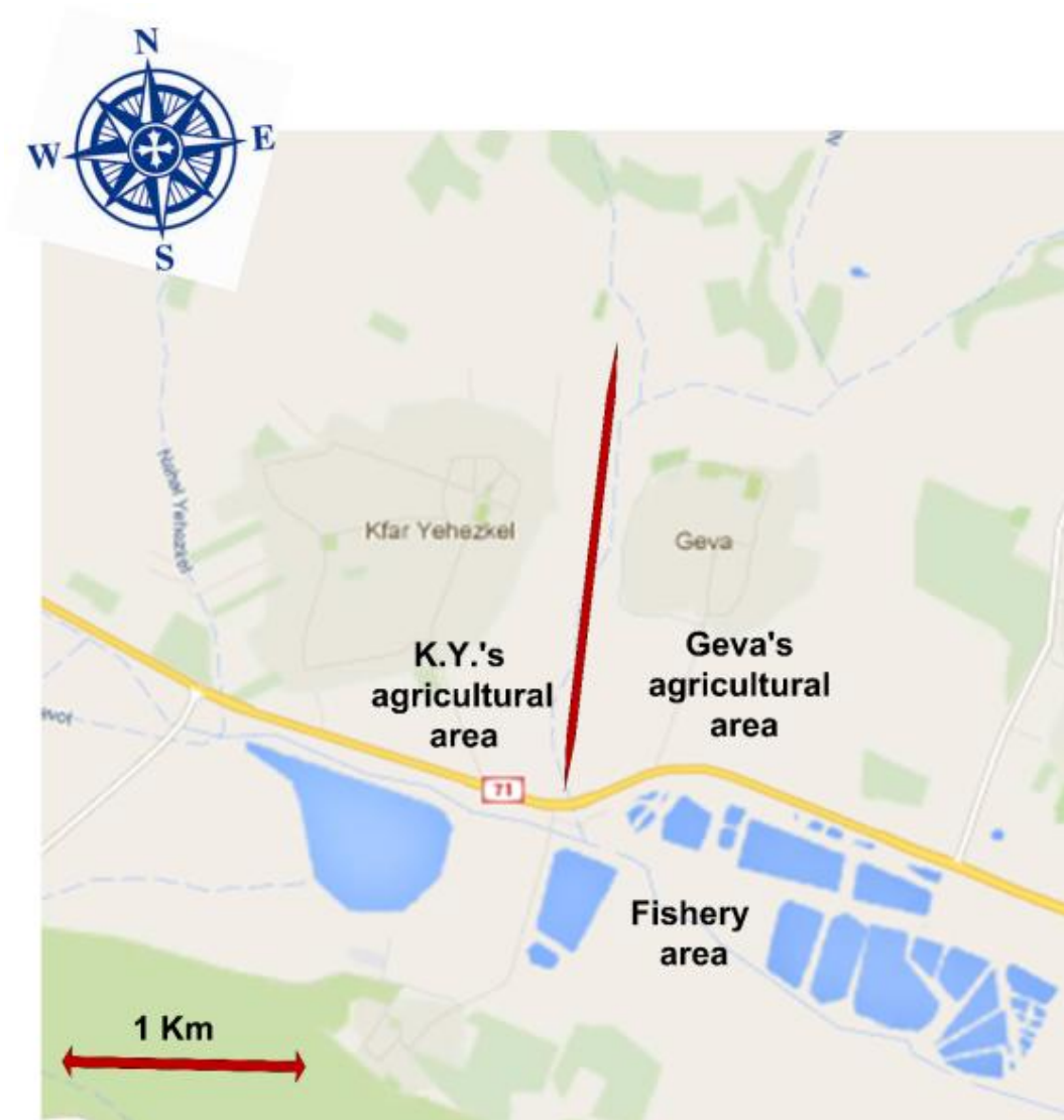
Fig. 2. Recent map (2014) of Moshav Kfar-Yehezkel (K.Y., left) and Kibbutz Geva (right)

The following map schematically represents the agricultural border between the two communities, and the fishery area.