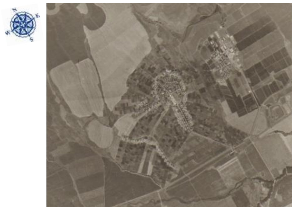
Fig. 5. Expansion of Moshav Kfar-Yehezkel and addition of agricultural lands to both settlements (1956)