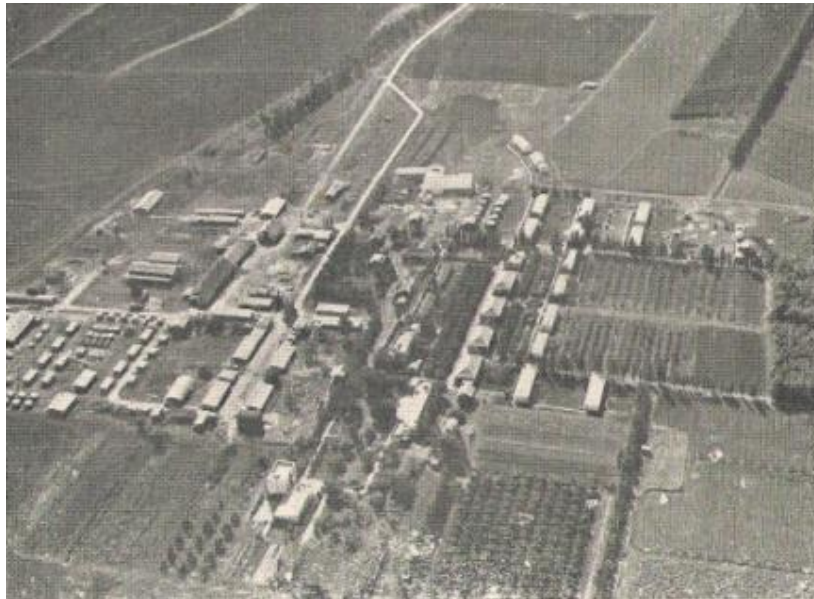
Fig. 7. Centralization of buildings and lands on Kibbutz Geva (1947)