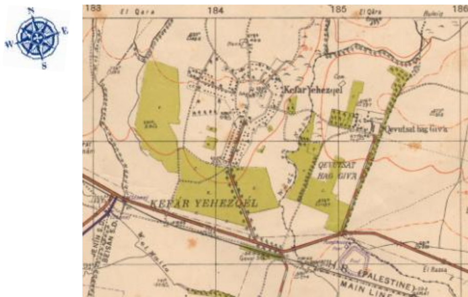
Fig. 4a. The map of Kibbutz Geva ('Qevutsat Haggiva') and Moshav Kfar-Yehezkel (Originally 1:20,000, 1941) 1Km