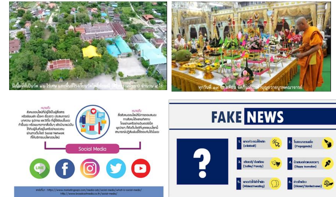
Figure 1. Show examples of developed media

The developed activities involved demonstration and workshop sessions on how to use online media safely and creatively.