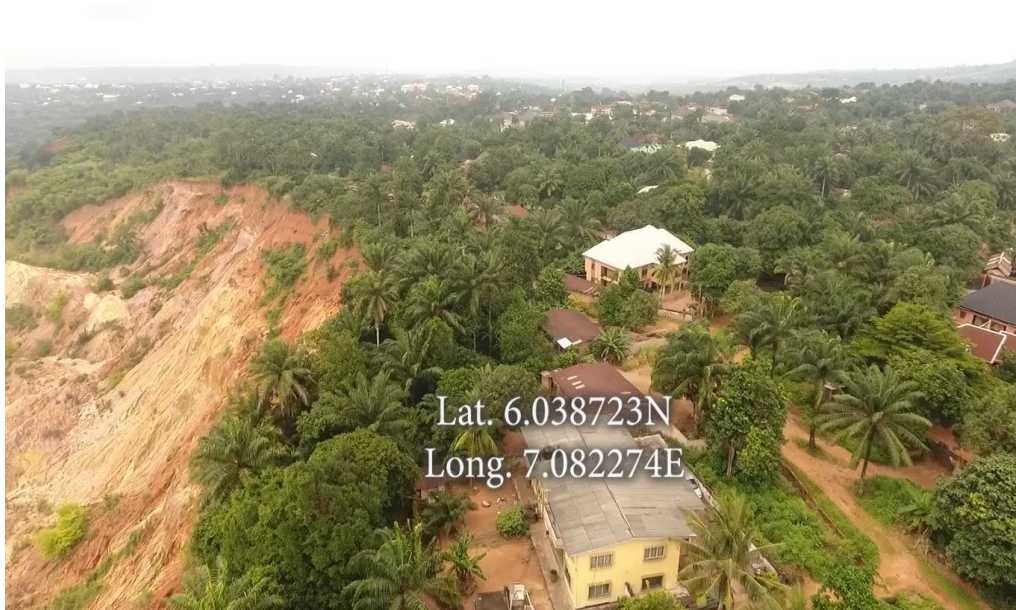
Fig. 5. Erosion progressing into the settlement in Ubahu Nanka)