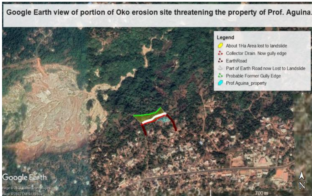
Fig. 4. Erosion progressing into the settlement in Ezioko