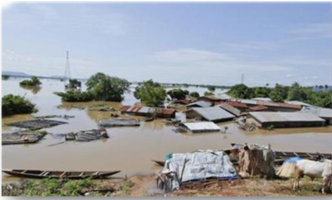
Fig. 3. Flood ravaged community in Ayamelum Local Government Area of Anambra State South Eastern Nigeria (Phil-Eze P.O. 2023)