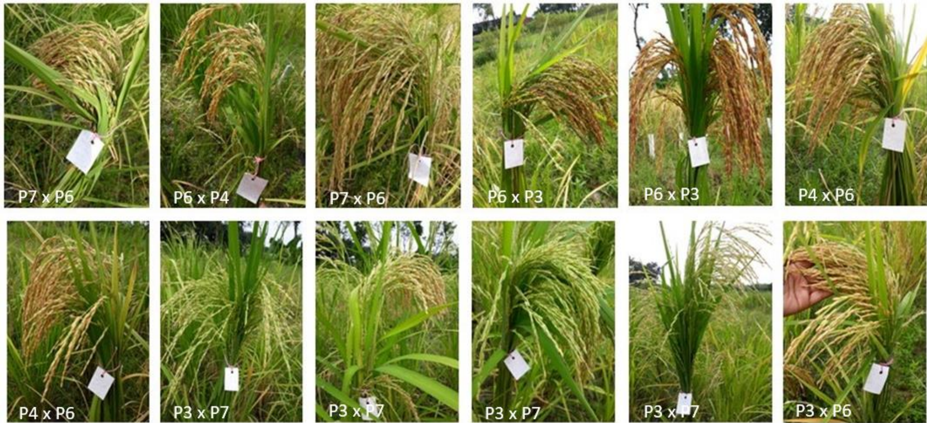
Fig. 2(B). Panicle length, grain number in panicle, grain color and shape variability observed in F 2 generation of Aus rice