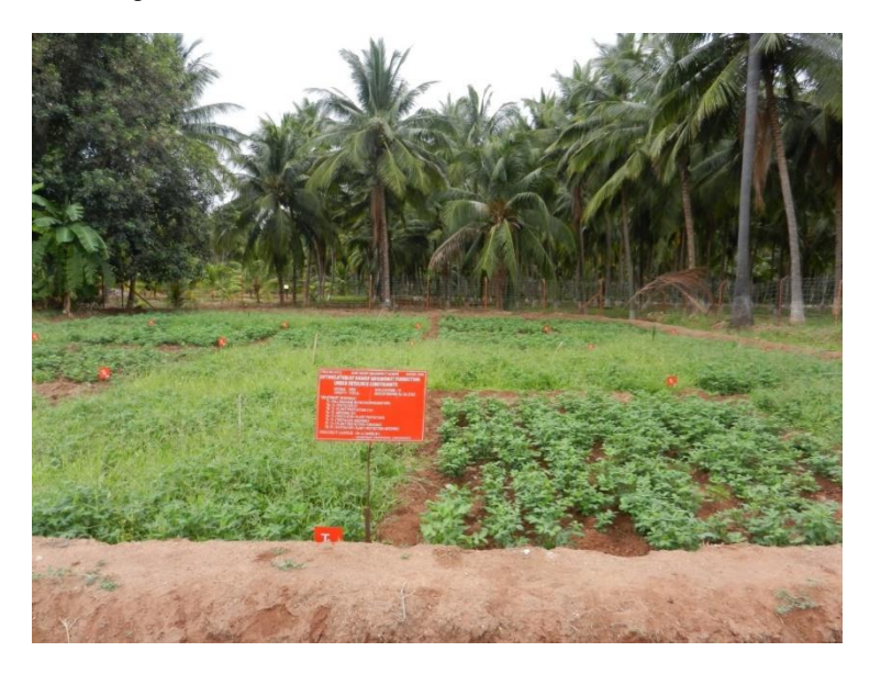
Fig. 1. Overall view of the Experimental Site

Yield attributes and yield recorded across different treatments is presented in Table 2. Number of pods per plant was highest in the treatment which received the full package of practice as per recommendation. The weight of dry pods per plant was highest in the treatment which received full package and was lowest in the treatment devoid of nutrient application, plant protection and weeding. One of the majorful factors responsible for low productivity of groundnut is weed infestation. Weeds present a formidable challenge to achieving optimal crop yields, competing fiercely with crops for essential resources like light, nutrients, water and space. In groundnut cultivation, weed infestation stands out prominently among various constraints [13]. Bhattarai et al., [14] postulated that groundnut crop compete with the repeated flush of diverse weeds throughout the growing season which causes substantial yield loss up to 50 -70 %. It is а natural corollary that the weed free environment has resulted in increased number of matured pods at harvest. As the crop was not infested by major pest, lack of adoption of plant protection did not have a great say on the number of pods per plant.