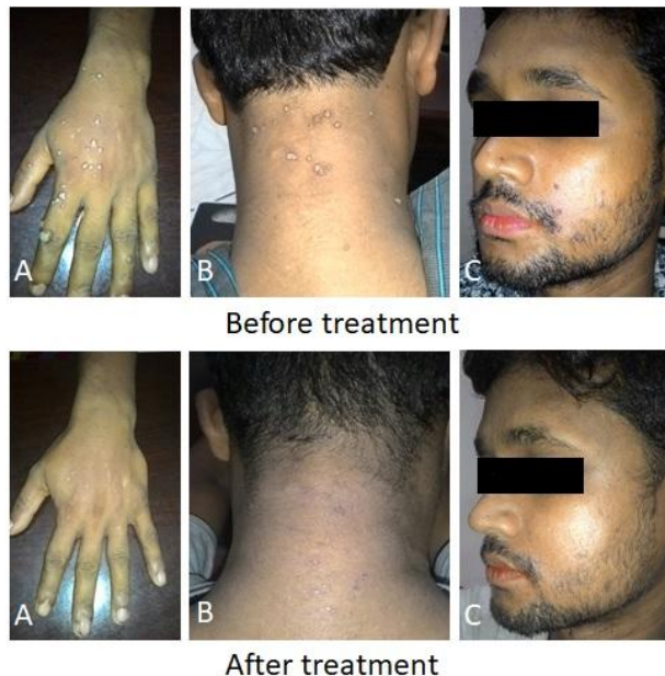
Fig. 3. Patient 3 (P3) Before treatment: Warts on the left hand (A), the neck (B), and the face (C). After treatment: Disappearance of warts from the left hand (A), the neck (B), and the face(C), within 14 weeks

All the patients were advised to maintain personal hygiene. The patients were also advised strictly not to scratch the lesion areas and not to apply for any topical medicine. Patient 3 (P3) was specifically instructed not to take betel leaves in any form.