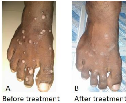
Fig. 2. Patient 2 (P2) Before treatment: Multiple warts on the right foot (A). After treatment: Cured after 8 weeks (B)

lesion area were captured from the beginning to the end of the treatment period. Physical appearances of the warts were compared with previously captured images on each re-visit.