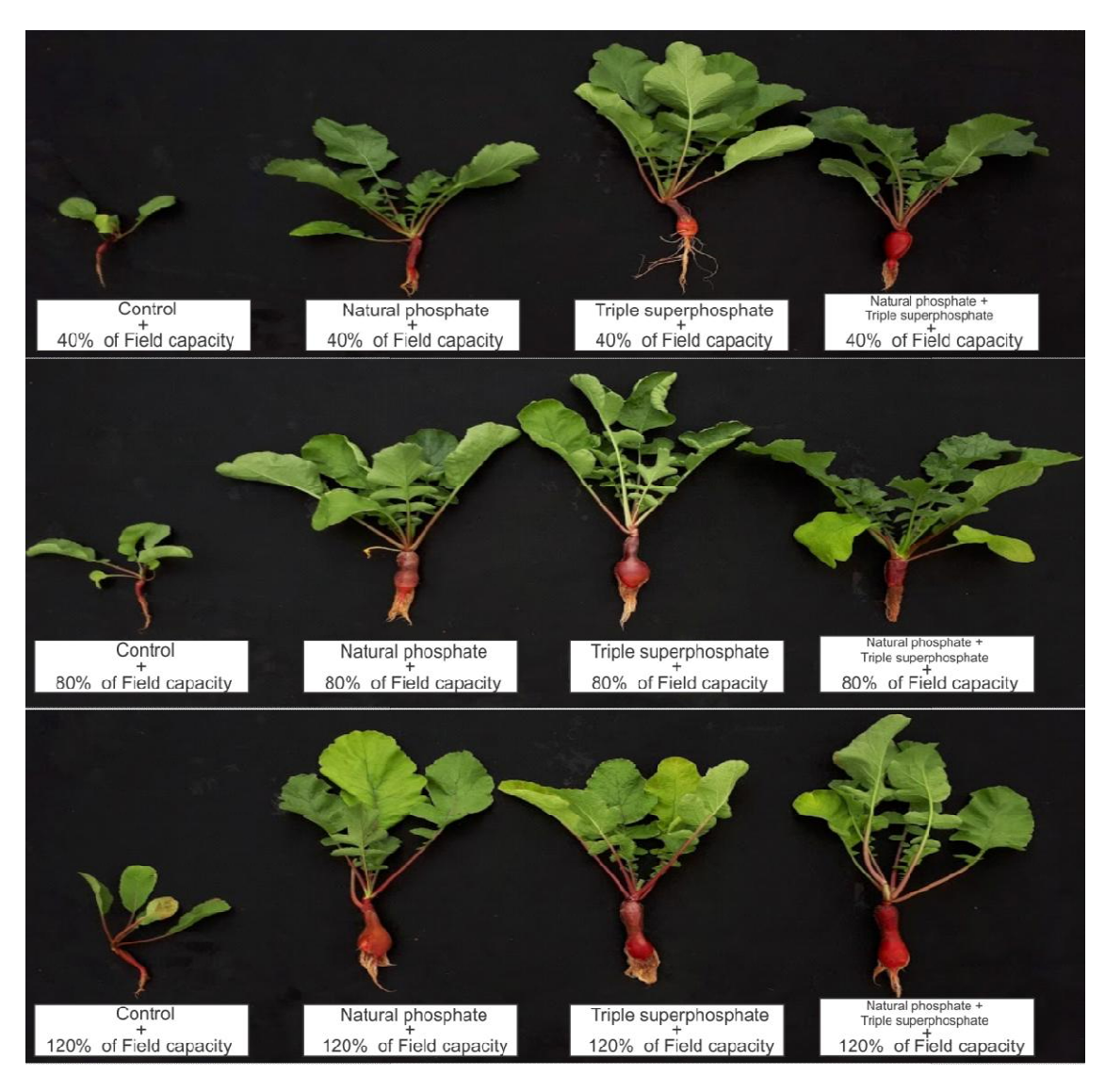
Fig. 1. Whole radish plants due to water availability and phosphate fertilization

Bonfim-Silva et al.; IJPSS, 29(3): 1-11, 2019; Article no.IJPSS.50473