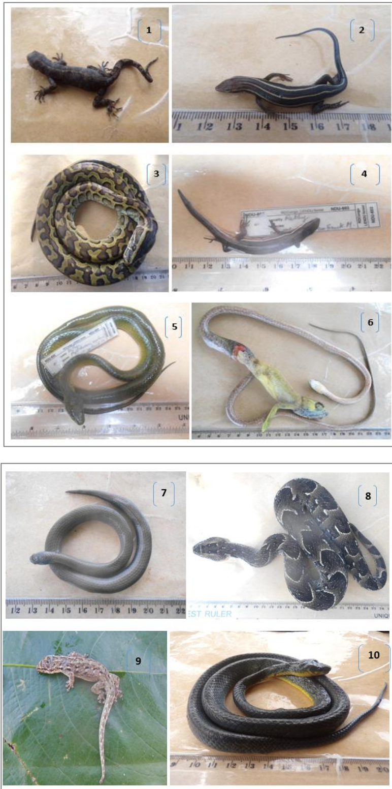
Fig. 3. Selected reptile species captured in the RAFALE landscape Cnemaspis sp (1), Trachylepis quinquetaeniata (2), Python sebae (3), Trachylepis sp (4), Philothamnus angolensis (5 and 10), Thelotornis kirtlandii (6), Duberria sp (7), Bitis arietans (8), Lygodactylus sp (9)