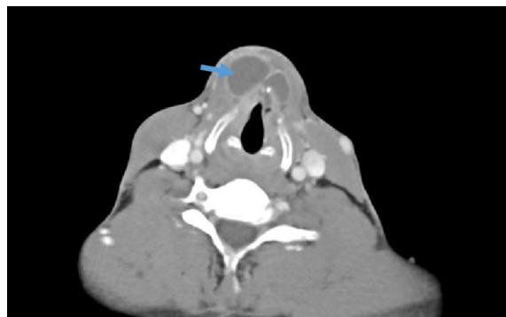
Fig. 1. Computed tomography of soft tissue neck revealed multiloculated fluid collections 1.7 x 3.0 cm [Arrow]