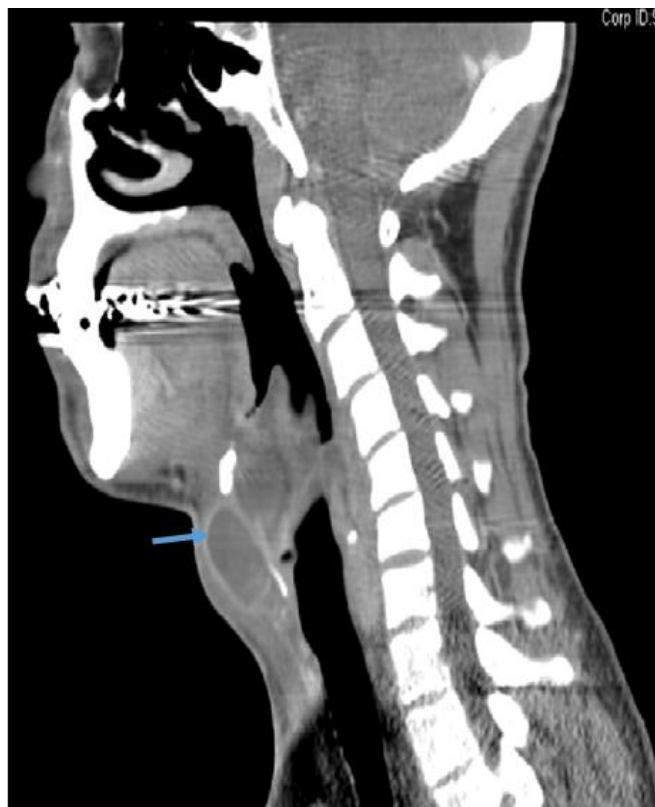
Fig. 3. Repeat CT neck soft tissue showed minimal interval enlargement of abscess [Arrow]

infectious disease clinic in 2 weeks patient had resolution of neck swelling and associated symptoms.