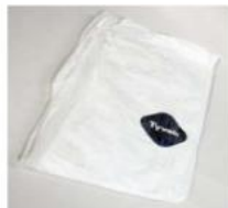
One tyvek cytotoxic gown