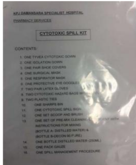
one spill management procedure