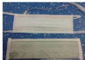
one surgical mask, one respirator mask