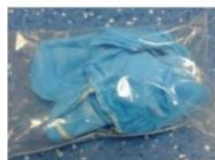
One pair shoe cover