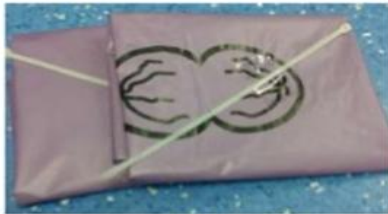
Two cytotoxic waste bags, Plastic ties with label