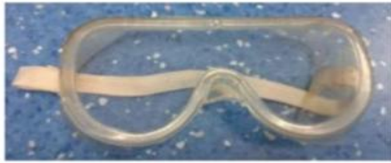
One protective eye goggles