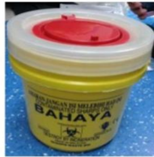
one sharps bin