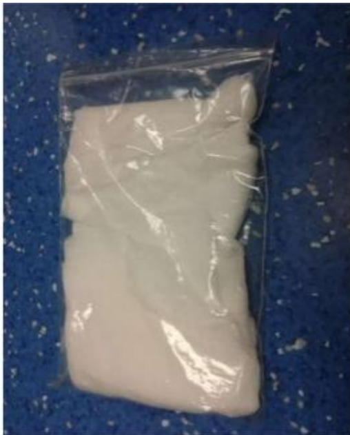
One pack gauze