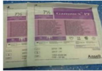
two pair latex gloves