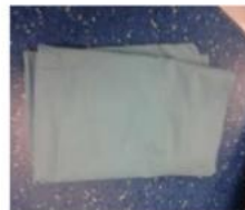
one isolation gown